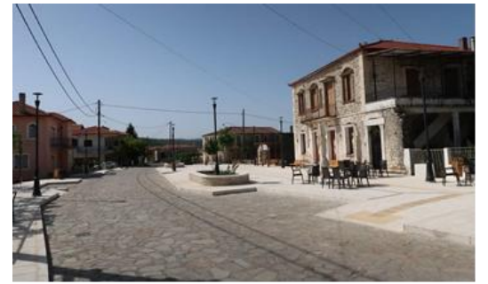
The renovated Rachi Square